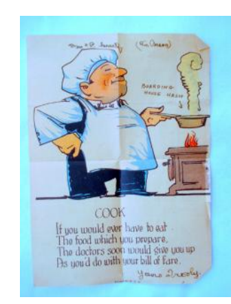
"If you would ever have to eat The food which you prepare, The doctors soon would give you up As you'd do with your bill of fare."

Makes us long for a Grub-spoiler's Tommy. Now Banyan days avast Admiralty ham And worse, Harriet Lane: