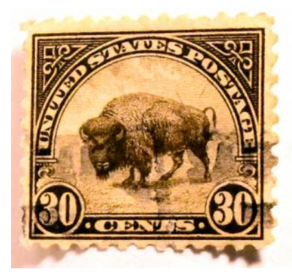
Commemorative Buffalo stamp.

<sup>8</sup>President Theodore Roosevelt oversaw the work for a trans-isthmian canal in 1903-13.