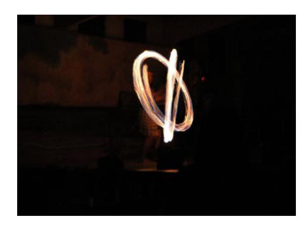
Kalamakii Fire Poiball Twirler, "Light Rings": Kilohana Plantation Luau, April 27, 2005.

And I'm afraid now My eyes and my hands Can't get to first base with you Even with my lucky underwear.