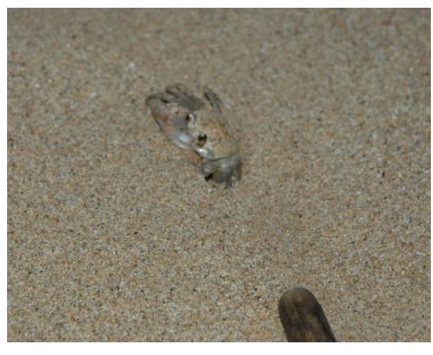
Hermit crab, inching away from my cane, at Kikiaola Beach, Lydgate State Park, Kauai'i.

After all, I'd rather be a piston Than a hubcap.