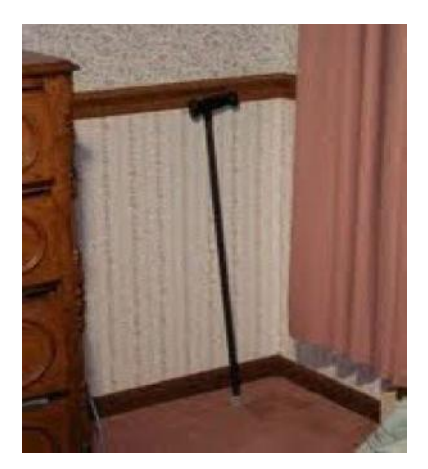
My cane, left in the corner. "How sweet it is."