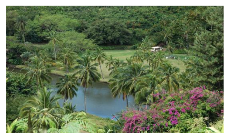
"Fantasy Island" Cove on the way to National Tropical Botanical Gardens, Kauai'i, HI.