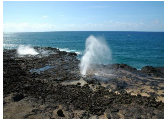
Geyser (Blow Hole): Spouting Horn, Kauai'i.

Just fold them up And stick 'em under his hat. Trouble is, When it finally blows What a waste of a perfectly good hat.