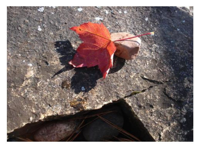
Red Maple leaf, North Shore of Lake Superior, MN.

Everyone falls to the ground eventually It's inevitable But for some reason Of all of us crumpled on the earth You noticed me And picked me up. Not only did you assign me value, You made me worth something again. Thank you For pressing me into new service.