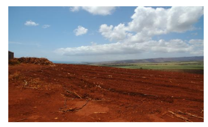
Rows of newly planted sugar cane seed eyes on the last operational Kauai'i sugar plantation, Kaumaka Olokele Sugar Mill, 2005. It ceased production in 2009.

The juxtaposition of words on a page Forming the diagnosis Pronounced upon my body Has pried up my emotions Like a pitchfork in hardpan. I can't quite put my finger on them yet, Solid, earthy emotions, But they are there. Other things, too. If I dig, Perhaps I can pick them up Like warm brown potatoes Or leave them awhile To sprout.