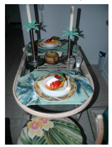
Table at Hali Lani Bed & Breakfast, Kapaa, Kauai'i, HI.

On the sidelines for awhile And I've been Darned angry about it. I wish I could do more. Life has me tongue-tied.