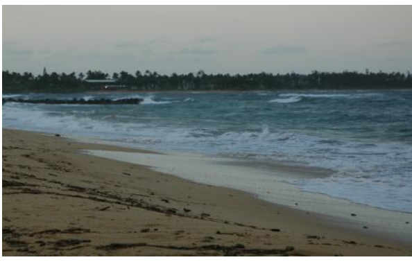
Foamy Beach at Lydgate State Park, Kauai'i.

Tips me all the way back Like the smooth going down As it slips past ears That don't catch the humor like they used to. Somehow I'm stuck to the sides of the glass."