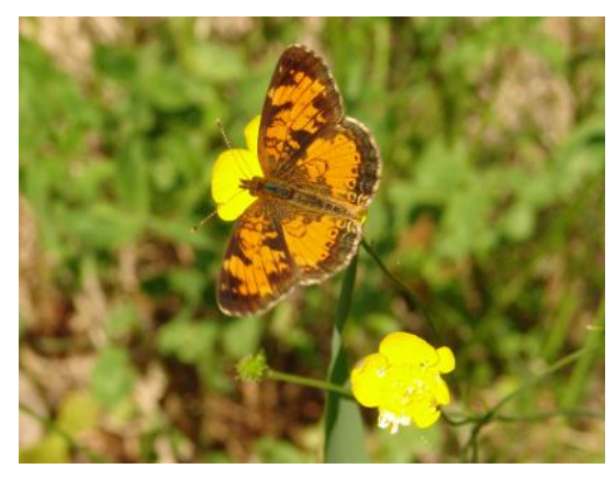
Pearl Crescent Butterfly (Phyciodes tharos), North Shore of Lake Superior, MN.

I'm not certain who you are But you sure are beautiful.