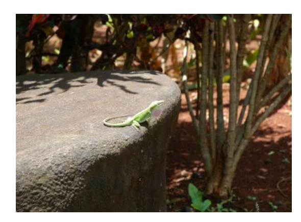
Anole at Allerton Botanical Garden, National Tropical Botanical Gardens, Kauai'i.

My eyes may not be saying much That you can read But from here they are delicious with fright. My tongue is more drool than syllable these days But it wishes it could scream to you From the edge of this cliff That I feel exactly 98.6 degrees north of normal.