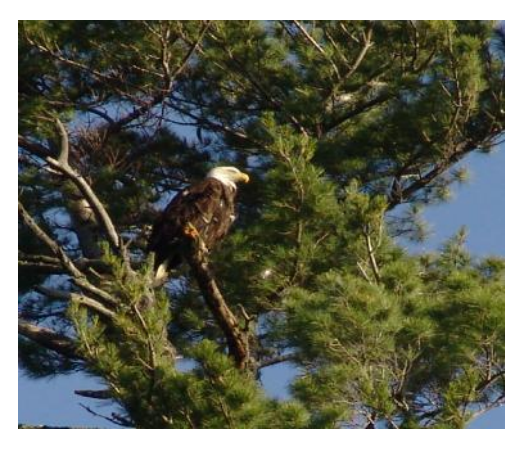
Bald eagle at Birch Lake near Babbitt, MN.

You, Reader, Are here. In spite of circumstances Hindrances In spite of your self You are here. A strong cord has tethered you Something of umbilical strength Defying age Interest, intention, Drawing you Gathering you in Picking you up Causing you Of all people To have hope again. Just a shred, a scrap But enough To stitch around To fashion a new garment, Serviceable Malleable Warm; Go ahead Try it on for size.