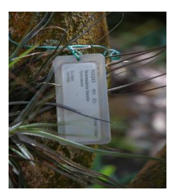
National Tropical Botanical Garden nomenclature plate, a tree's "dog tag".

The dog was all She got from the split After her head Had broken open But, surprisingly, that was all she truly needed.