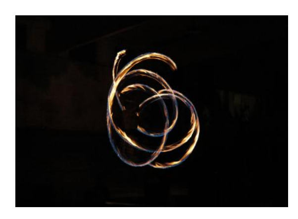
"Light Rings": Kilohana Plantation Luau; Kalamakii, Fire Poiball Twirler, April 27, 2005.

I find myself content, largely, With the unexpected pleasure Of not knowing I should be upset; Not even longing for the flashes I once called brilliance; Content when they just show up— Or not.